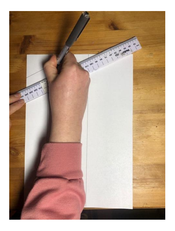
Then draw diagonal lines at 45 degrees in each column